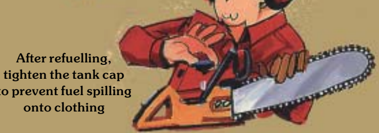
After refuelling, tighten the tank cap to prevent fuel spilling onto clothing