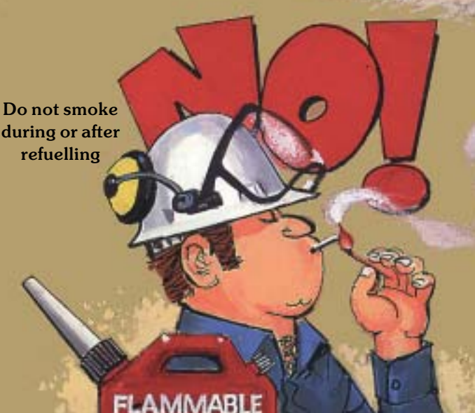
Do not smoke during or after refuelling