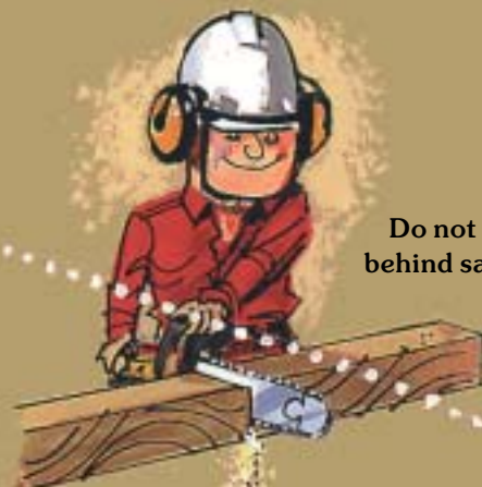
Do not stand directly behind saw while cutting