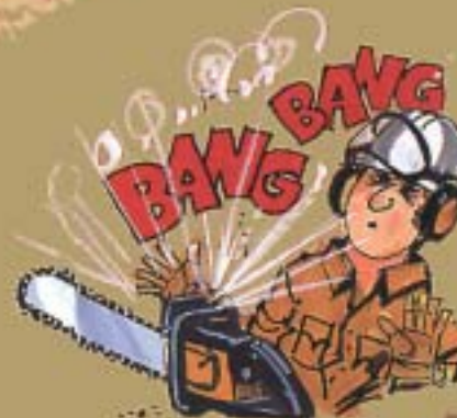
Do not operate saw if it is backfiring