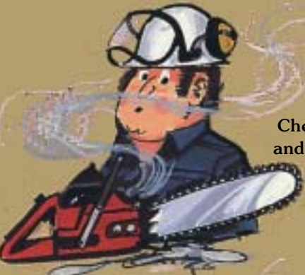
Check fuel line, tank cap and connections for leaks

Many chainsaw operators have suffered injury while refuelling. Some tips on safe refuelling procedures: