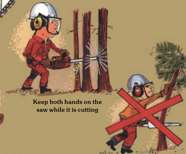
Keep both hands on the saw while it is cutting