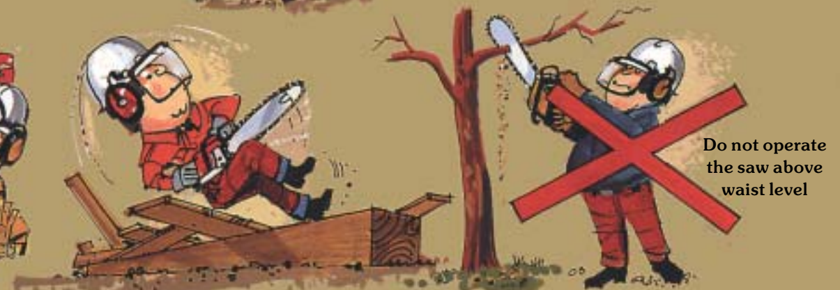
Do not operate the saw above waist level