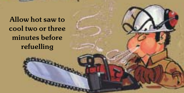
Allow hot saw to cool two or three minutes before refuelling