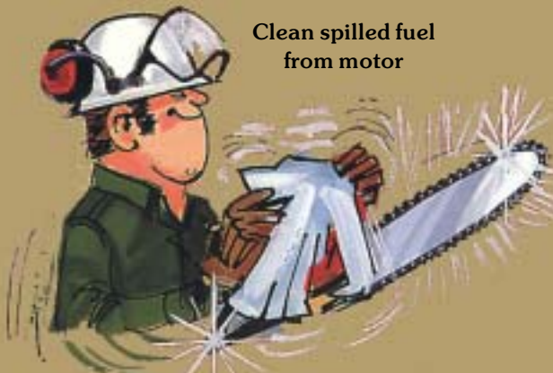
Clean spilled fuel from motor