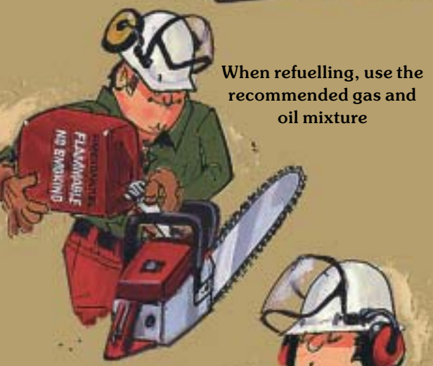
When refuelling, use the recommended gas and oil mixture