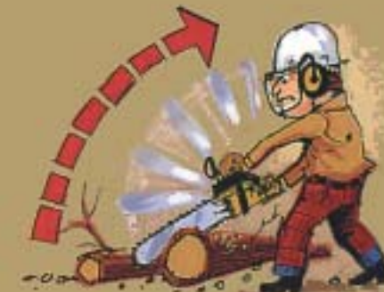
Avoid kickback situations