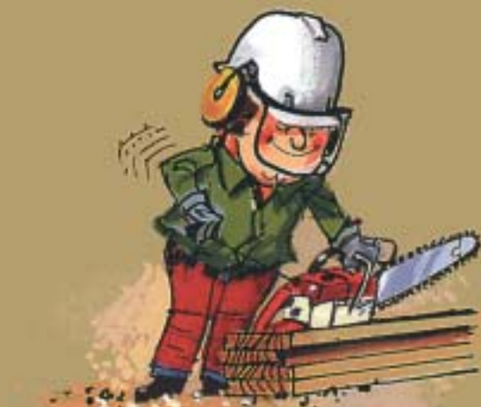
Use safe methods of starting a saw

Chainsaw operators are encouraged to receive training in the safe handling of saws and the use of proper cutting methods before attempting any cutting tasks. Some basic operating and cutting tips are illustrated.