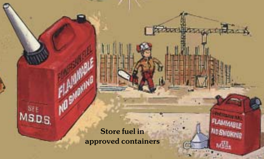
Store fuel in approved containers